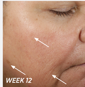
White or Caucasian, FST II