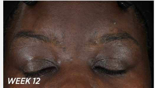
Black or African American, FST VI