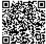
QR code link for BOTOX® Patient Information Leaflet

To follow your results and for other documentation reasons, you may be photographed and the results recorded in your confidential patient file. To maintain the benefits of your treatment, it is recommended you have a re-treatment in 4 months. 4